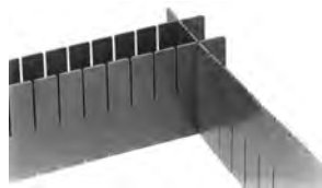
tote box dividers