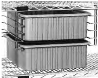
slide system with tote boxes