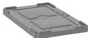
tote box cover (for TB1016 and TB1722 series)