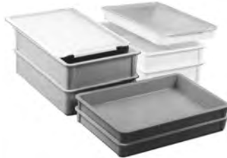
assorted molded fiberglass boxes and trays