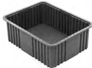
TB1016 and TB1722 series

*Model #A208513 lid fits models A208506, A208507, and A208508 stacking boxes.