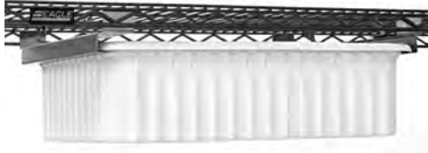
adjustable undershelf slides with tote box