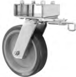
swivel/lock plate caster