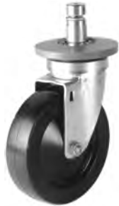
swivel caster with resilient tread

* See charts for complete model numbers.