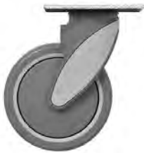
polymer plate caster