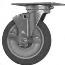
stainless steel pressure-washable caster (with brake)