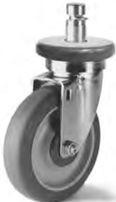
(nickel-plated) caster with polyurethane tread