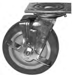
polyurethane plate caster with brake