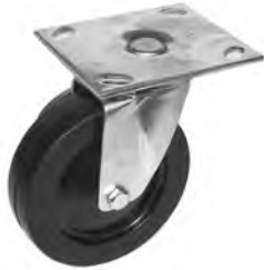
resilient plate caster

* See charts for complete model numbers.