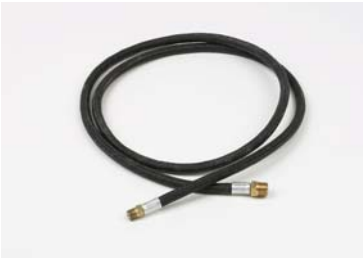
101-, 102- Series