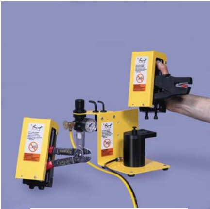
Easy module change

Fits a variety of pliers, cutters, crimpers, strippers, pop riveters, scissors, snips and other pivoted hand tools from about 5" to 12" (125 mm—300 mm) long.