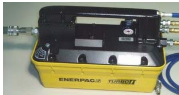
“Remote Footswitch” Hydraulic Pump