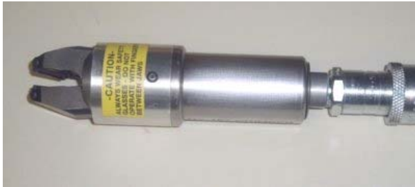
HYP-125, HYP-187 & HYP-250