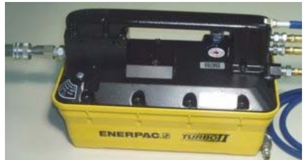
“Remote Footswitch” Hydraulic Pump