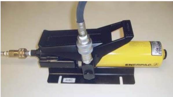
“Standard” Hydraulic Pump