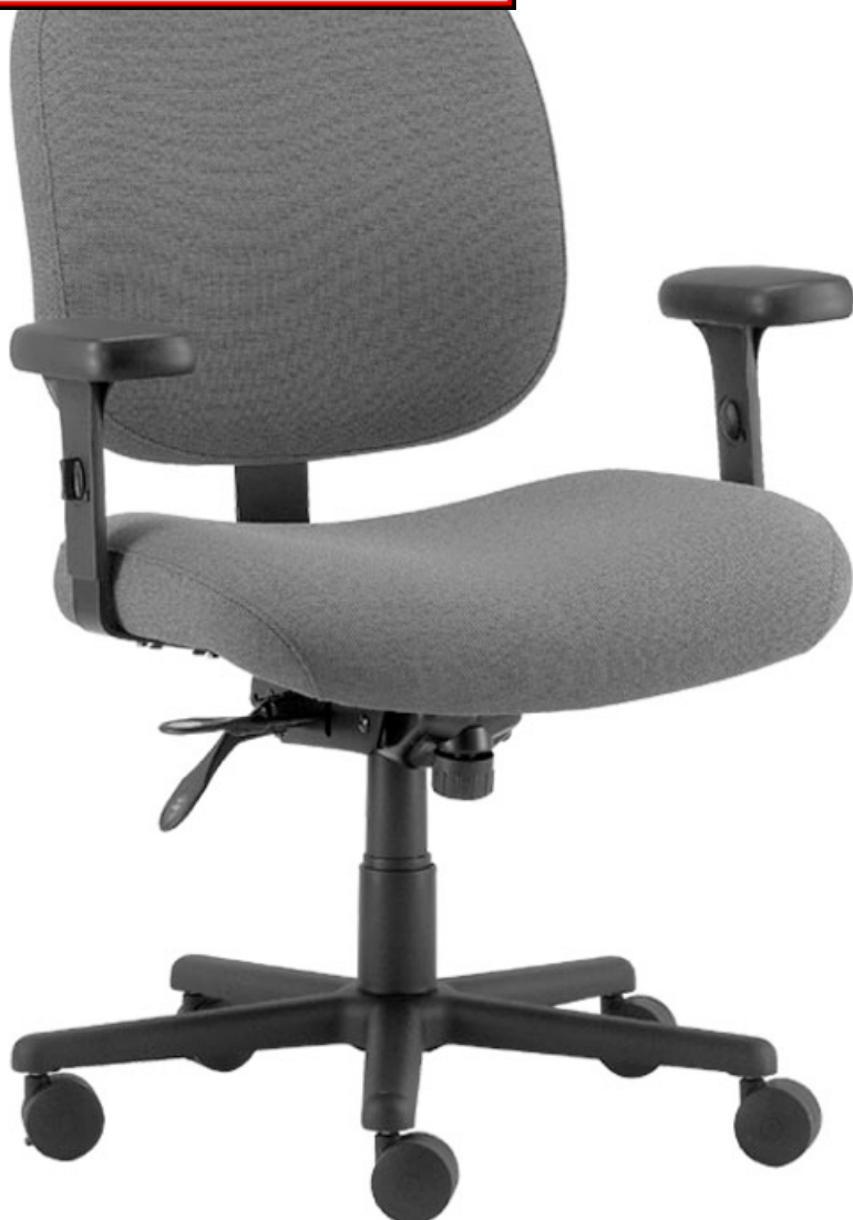
Model 10,000 Office with optional armrest and gel arm pads