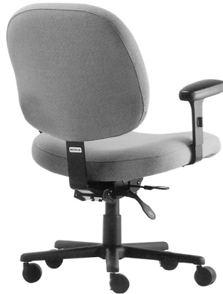
Model 10,000 with optional armrests and gel arm pads

BEVCO's 10,000 Series of ergonomic chairs has been designed and tested to address the specific seating requirements of larger workers. Every component of these high capacity chairs has been rigorously tested to assure exceptional strength and years of durability. The entire chair, including the heavy-duty base, seat, tilt mechanism and larger casters has been tested by an independent lab** to reliably handle all the stresses applied by a 500 lb. person. The 4" thick seat, constructed of 3/4" 14 ply hardwood and high density foam, is built for maximum comfort as well as years of reliable use.