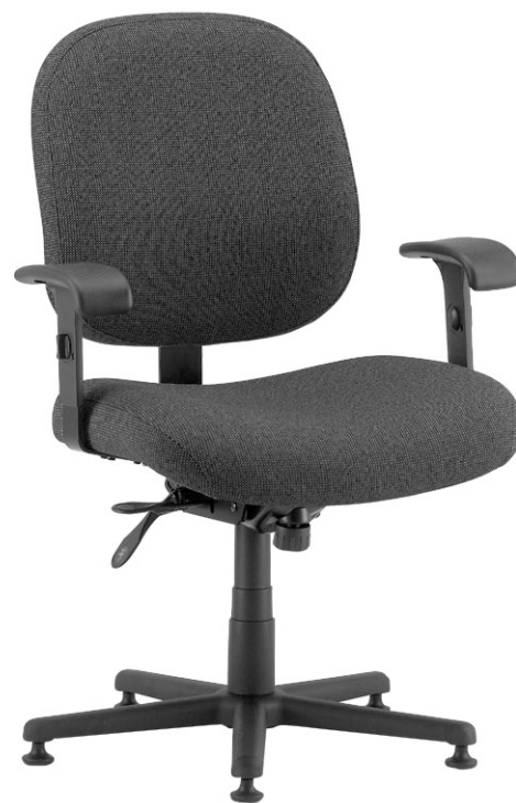
Model 10,000 Industrial with optional armrest and polyurethane arm pads